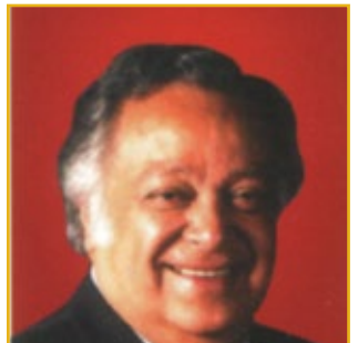
Sir Shridath Ramphal Guyana/Barbados